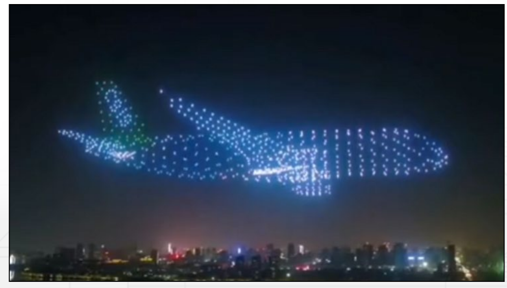
Drone show: multi-agent deployment